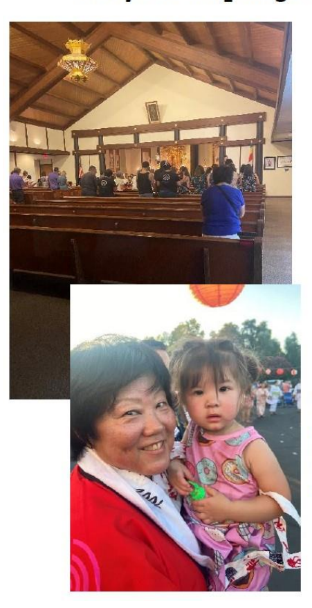
With new generations learning to dance

Thank you to Everyone for making this year's Obon a success. All your help is greatly appreciated. See you at next year's Obon!