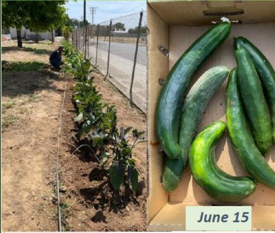
Sunomono prepared by JoAnn from freshly picked cucumbers