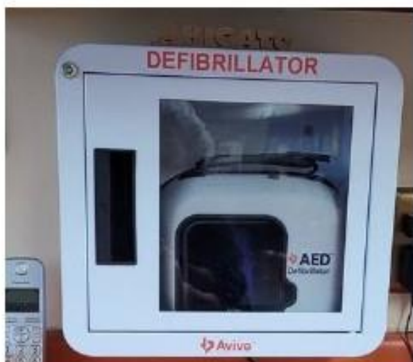
Two New Defibrillators Within BCF Facilities — one in the kitchen, the other in the gym

BWA purchased new MPR-gym tables (during past 2 yrs.) and these new heavy-duty MPR chairs last year (which just arrived).