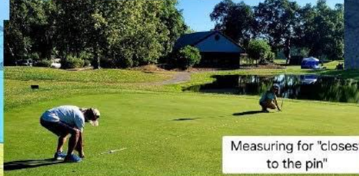
Measuring for "closest to the pin"