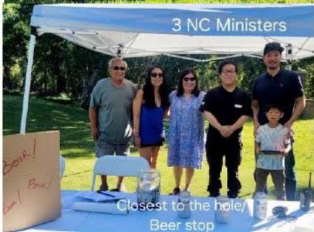
3 NC Ministers