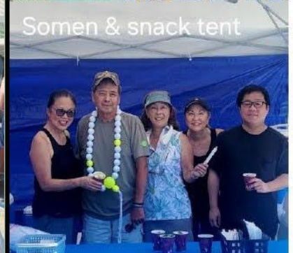
Somen & snack tent