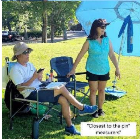
"Closest to the pin" measurers