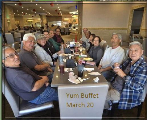
Yum Buffet March 20