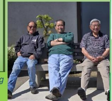
After a long morning ... (before lunch)